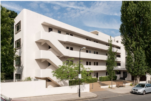
Wells Coates, ISOKON Building or Lawn Road Flats, London, 1934

What held organic modernists together was “organicism,” the idea that the