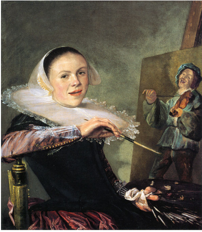
Judith Leyster, Self-Portrait, 1633