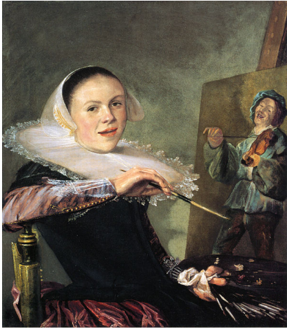
Judith Leyster, Self-Portrait, 1633